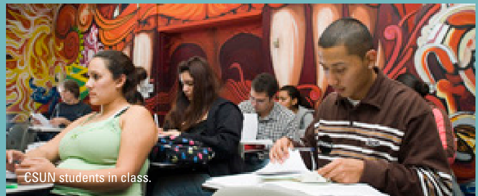
CSUN students in class.