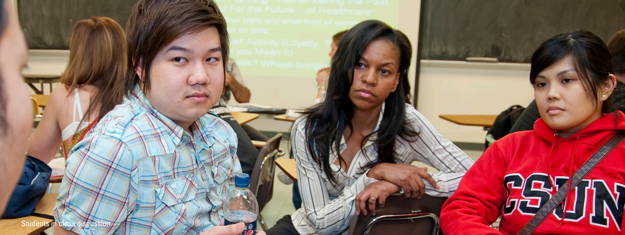
Students in class discussion.