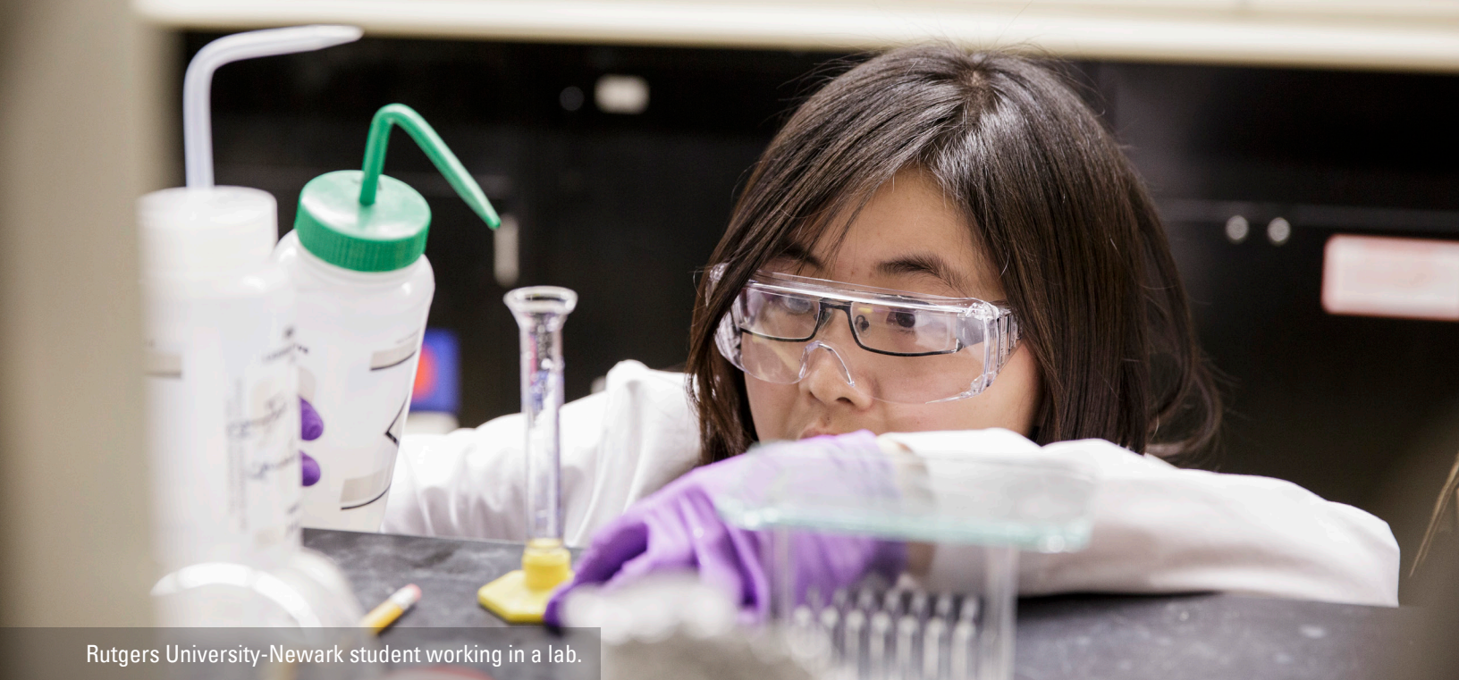
Rutgers University-Newark student working in a lab.

pull warehouse data from Rutgers Institutional Research, do further analysis, and provide meaningful data to decision-makers. Twice a year, he meets with deans and their associate deans to review the data for their departments and discuss the implications of lost tuition revenue, among other things. These meetings, and the data, form the basis for further discussions with leaders as they look at their departmental retention and completion data and work to address issues such as why students are leaving their programs, where they are going, what potential factors are associated with their departure, and how to identify approaches to stop the loss. At Newark, sessions with deans to date have been limited to the Business School, but with the recognition that they need to be broadened to include all deans.