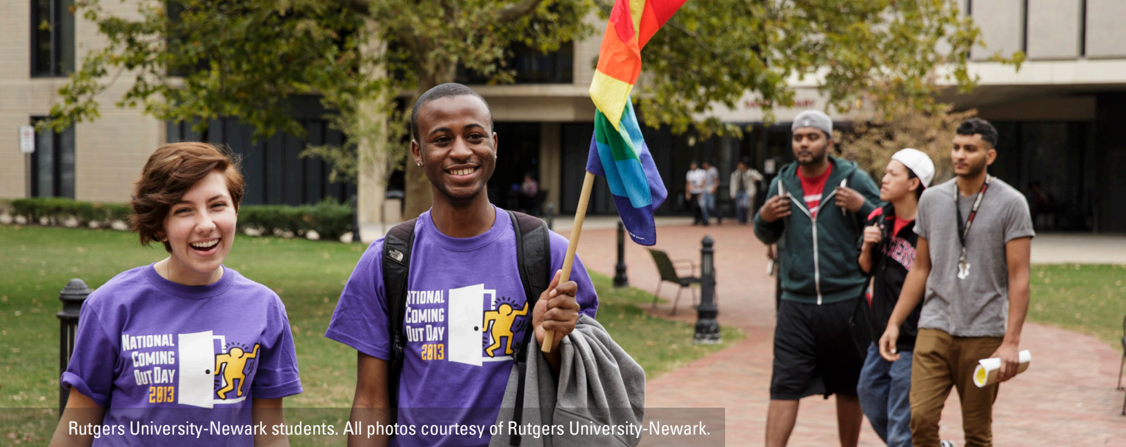
Rutgers University-Newark students.

While Newark has been serving nontraditional students for almost 80 years, the university has not always been the most welcoming place for such students. The administrators and faculty we talked to told us that as recently as the mid-1990s, the campus had a rather negative stance toward diversity and difference of any kind. Students, at the time, reported either poor treatment or not feeling welcome based on their racial, ethnic, religious, or sexual preference identification.