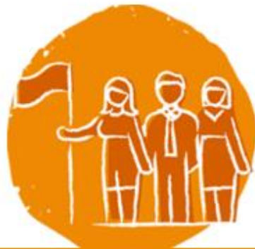
SCHOOL LEADERSHIP QUALITY & DIVERSITY