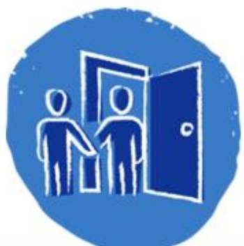
POSITIVE & INVITING SCHOOL CLIMATE