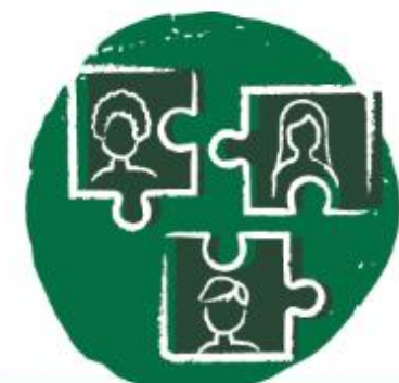
DIVERSE CLASSROOMS & SCHOOLS