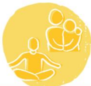
STUDENT SUPPORTS & INTERVENTION