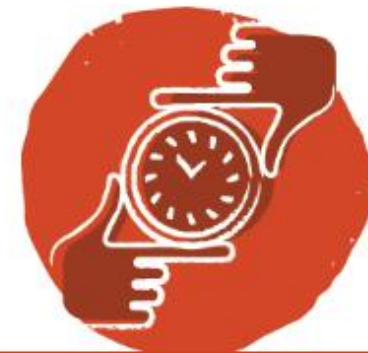
INSTRUCTIONAL TIME & ATTENTION