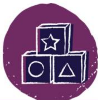
HIGH-QUALITY EARLY LEARNING