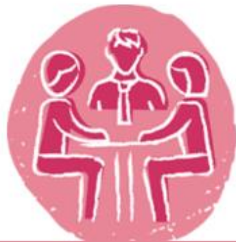
TEACHING QUALITY & DIVERSITY