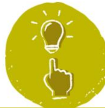
EMPOWERING, RIGOROUS CONTENT